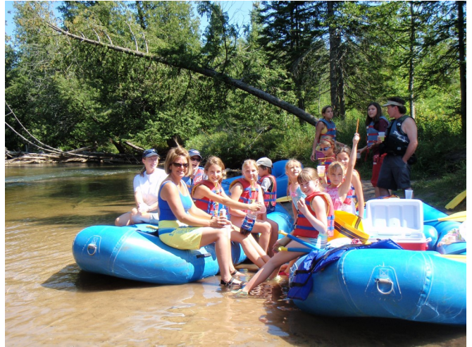
We've hosted groups from all over Michigan, and all age groups.